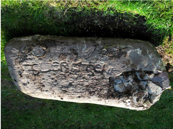
The West Down inscribed stone with name 'GUERNGEN'.

emergence of Anglo-Saxon England. Both in south and west Wales and in the southwestern peninsula of England, stones bearing inscriptions – principally in Latin – and dating from the 5 th to 8 th century have been known and studied for some time. In the South West, Cornwall has the lion's share, while the relatively few in Devon are distributed principally around Dartmoor and into the South Hams. Excluding four examples on Lundy, northern Devon has – or had – only the CAVUDUS stone which stands in a garden in Lynton parish, while on Exmoor there is only the CARATACUS stone on Winsford Hill. The inscriptions