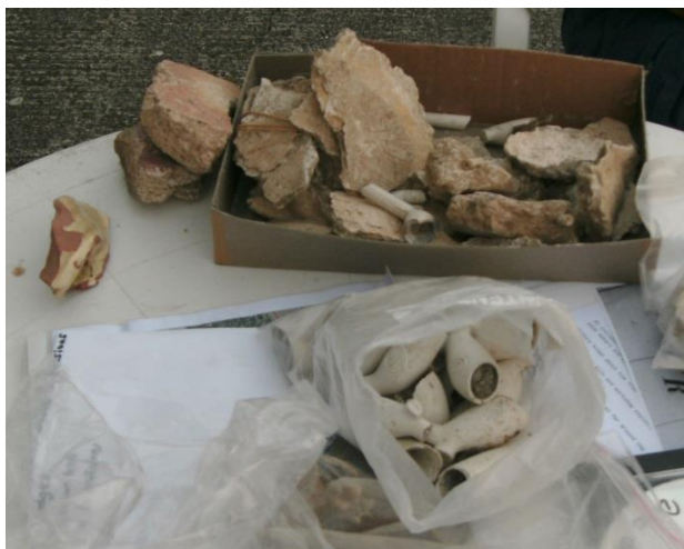
Some of the material collected from the site