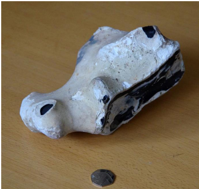
Large flint nodule found in the River Heddon at Holworthy Farm, Parracombe. (50pence piece for scale)

overlying the local Devonian rock, but it looks nothing like the flint that we see at Orleigh Court, where there is a small, natural deposit of clay with flints (the residue left behind when the chalk matrix has been weathered away). Was it traded into the area as raw material in prehistory? Worth considering., but without pack ponies or wheeled transport a very heavy proposition. On the other hand, in what form WAS flint brought into an area where it is not naturally present? Something to think about.