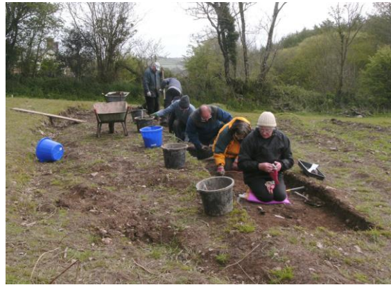
Happy diggers at Little Potheridge

Just for your interest and information therefore, here are a few details of what we know at present.