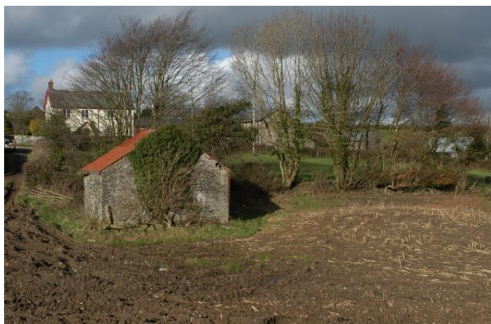
The possible kiln site

With the permission of the landowner Clinton Estates, and following on from geophysical survey, NDAS has a new excavation going at Little Potheridge near Merton (between Great Torrington and Hatherleigh) where there is artefactual and documentary evidence of clay-pipe manufacture in the 18 th century and possibly earlier. The excavation of a clay-pipe kiln is a rare occurrence and the results could be nationally important. The excavation