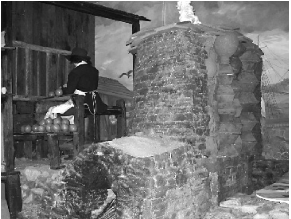
The reconstructed pottery kiln in the Museum of North Devon. The reconstruction is based on mid-17th century remains found on the site of Barnstaple Library and on experimental firings undertaken by the Bickley Ceramics Project.