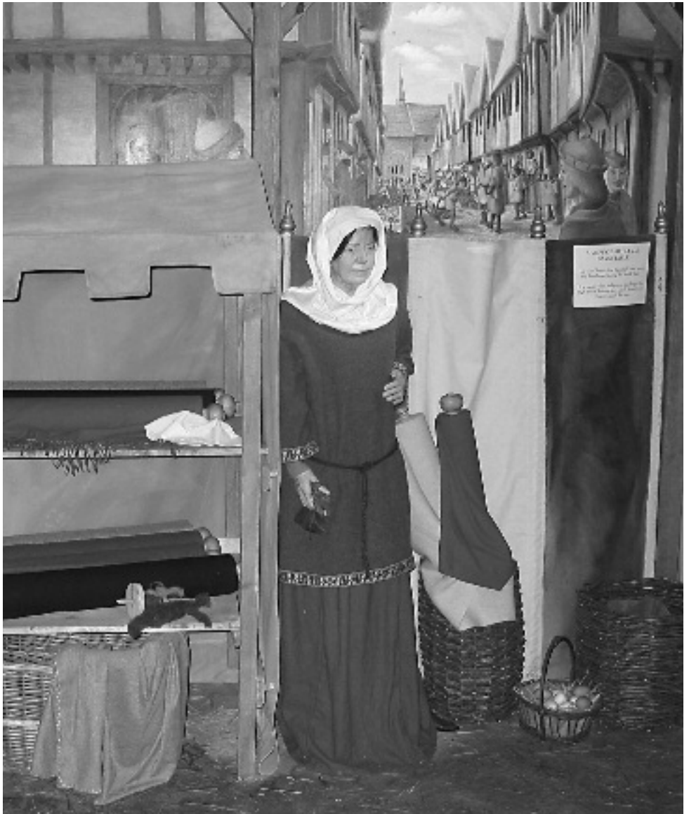
Medieval Barnstaple: A cloth seller in Barnstaple's medieval market. In the background, a mural with a view of Cross Street looking towards the West Gate.