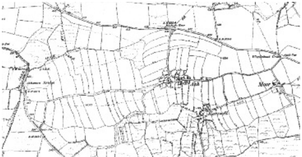
Fig.1: Parkham Ash, as it appears on the First Edition OS 6" map of 1889.

The Nympton parishes lie adjacent to the River Mole and it is suggested by Ekwall (Oxford Dictionary of English Place-names, 4th edition 1960, 346) that Nymet is an old name for the Mole (Mole being a back-formation from Molton). It appears, however, that the Nymptons together may represent an ancient large land unit from which the river took its earlier name. In the Saxon period this was a royal estate, of which part was granted to the Bishop of Exeter. If all of the Nymptons represent a single large early estate, it would be quite characteristic for it to be named