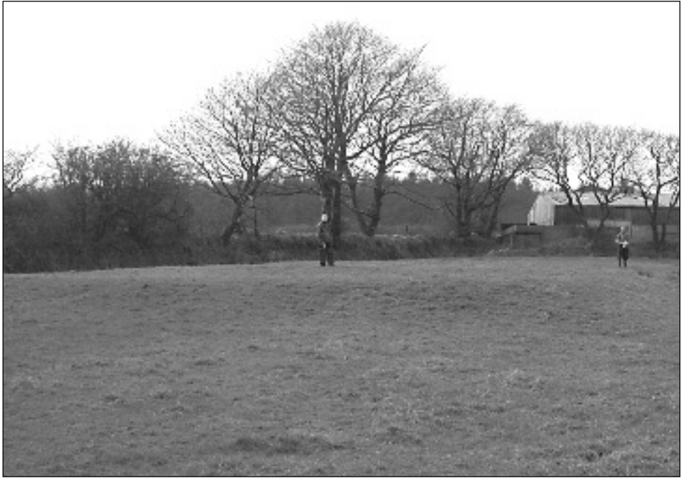
One of the raised, building platforms in need of survey and recording.

have the support of the Hartland Society, we are always on the look out for more help. For many, this will be a good opportunity to get some hands-on experience of surveying.