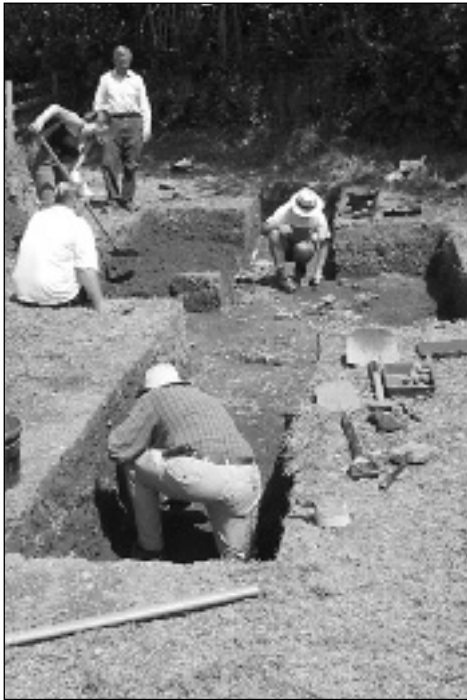
Excavating a Romano-British working platform at Brayvale. (NDAS members working with South-West Archaeology)

It seems possible that evidence of Romano-British iron-working will be found all the way down the valley from Sherracombe to Brayford. Both excavation and geochemical survey at Brayford in 2001 had already revealed a large smelting area associated with pottery of Romano-British date. In the village of Brayford iron-slag is found over a