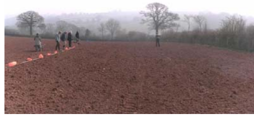
Fieldwalk in Mead 2, March 2011

In March members successfully completed fieldwalking New Close, the northernmost field on the farm, completing the collection of flints from that field. We then started walking a new field, "Mead 2", south of the farmhouse. Once again Mesolithic blades were found, along with some very nice scrapers and cores. Some small burned areas were also noted, but very little pottery, a similar result to the first two fieldwalking sessions in this field. The flints will be washed and recorded, and their distribution noted for density plotting. Thanks to all who took part.