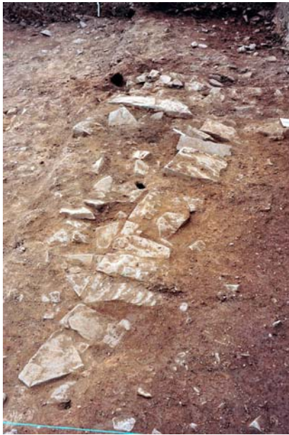
Alignment of facing stone in T5

From 8-12 April members undertook further excavation in the garden and meadow south of West Yeo farmhouse, with the aim of investigating the extent of the wall found in 2010. Two 5m 2 trenches were opened, T4 in the garden and T5 immediately to the south in the meadow. A mechanical digger removed turf and topsoil to a depth of approx 0.5m. The soil removed represented made-up ground and the digger allowed us to reach archaeology quickly. We owe thanks to Chris Preece for his professional supervision of the machine work.