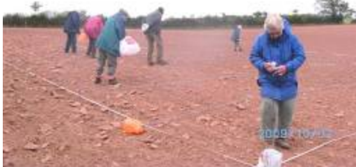
Field walking in New Close

This was a continuation of the field-walk which we had started last year. Over a period of eight days in pretty awful weather, twenty-one people joined us, including four members from TAG (Tiverton Archaeological Group), one from the ALF (Adult Learning Forum) and three new NDAS members joining us for the first time. Ages ranged from 9 yrs to 70+! We also had enquiries from some students at Exeter University, and it is hoped they may join us for the dig in July.