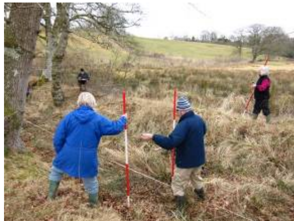
Surveying the causeway at West Yeo

We began this season's work by spending two days planning the 'causeway' down to the river Little Dart. In good weather six intrepid members measured and plotted a profile and a plan of the 'causeway' (79m in length). Thanks are due to Terry Green for his supervision and Brian Fox for spending time showing members how to use the dumpy level for finding levels. We now have a good plan and profile drawing to include in the archaeological record. We also probed the "road" surface and found evidence of a stone layer, which appears to be metalling. At a future date we need to uncover an area to ascertain the nature of the buried surface.