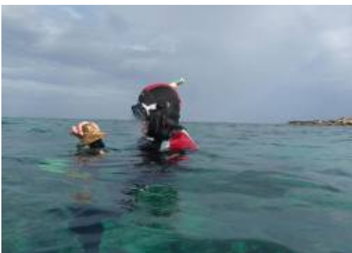
Fig.4: Author examining amphora stopper

The Director of the Department, Ibrahim Tuwahni, also encouraged me to look at Boreum, a walled Byzantine site published, coincidentally, by Goodchild in 1951. As it was located inside the oil company compound it was subject to tight security, making it difficult for even the Department's head to access! Here though was an ideal opportunity for me to enthuse my students with a 'hands on' approach to History. We made field trips where we identified some new extramural structures, recorded other features using photography and scale drawing (Fig. 2) and sampled some pottery sherds. The latter were reconstructed by the children in the classroom (Fig. 3) and were the first published ceramic evidence from the site.