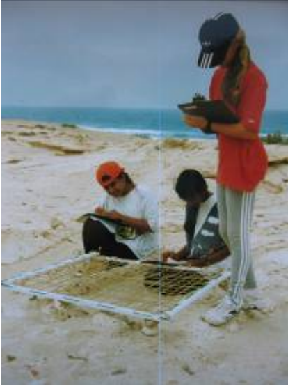
Fig.2: Planning a grave cut, Boreum

least two wrecks (C1 AD and Byzantine) which, with the permission of the Department of Antiquities, I spent week-ends surveying and later writing up.