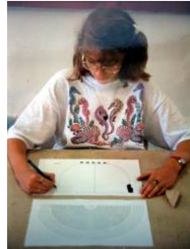
Fig.3: Pottery Reconstruction.

My association with Libya is altogether more mundane. In 1995, I took a post as a teacher for an oil company school in Marsa-el-Brega. As I socialised within the expat community, I began to notice a number of amphora fragments on the mantelpieces of houses there. The beach nearby was in fact the western side of a headland anchorage and underwater survey revealed at